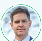
Ondřej Dostál Member of the European Parliament, Non-attached, Czech Republic Member of the committee on Environment, Public Health and Food Safety (ENVI) Member of the Delegation for relations with Southeast Asia (DASE).