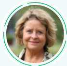
Stine Bosse Member of the European Parliament, Renew, Denmark