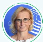
Kateřina Konečná Member of the European Parliament, Non-attached, Czech Republic Substitute member of the Environment, Health and Food Safety (ENVI) committee and the Public Health (SANT) subcommittee Full member in the Internal Market and Consumer Protection (IMCO) committee